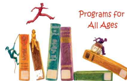
Programs for All Ages

In addition to providing informational materials, the Library hosts many popular programs such as: Baby/Toddler Story Time, "Armchair Travelers" Book Club, "Hour of Code" computer programming for teens, monthly "History at High-Noon" programs,