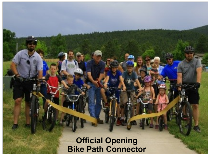
Official Opening Bike Path Connector

The City Engineer began work to replace the Old Stone Shelter in the City Park. A new shelter will be in place by early summer of 2017. Design work also began on the Ft. Meade South Loop Project. This 2.5 mile, crushed limestone, recreational trail around the Ft. Meade campus will include points of historical significance and informational signage. The new trail will tie into the existing City recreational trail that runs from downtown Sturgis to the High School. The trail will be complete in 2017.